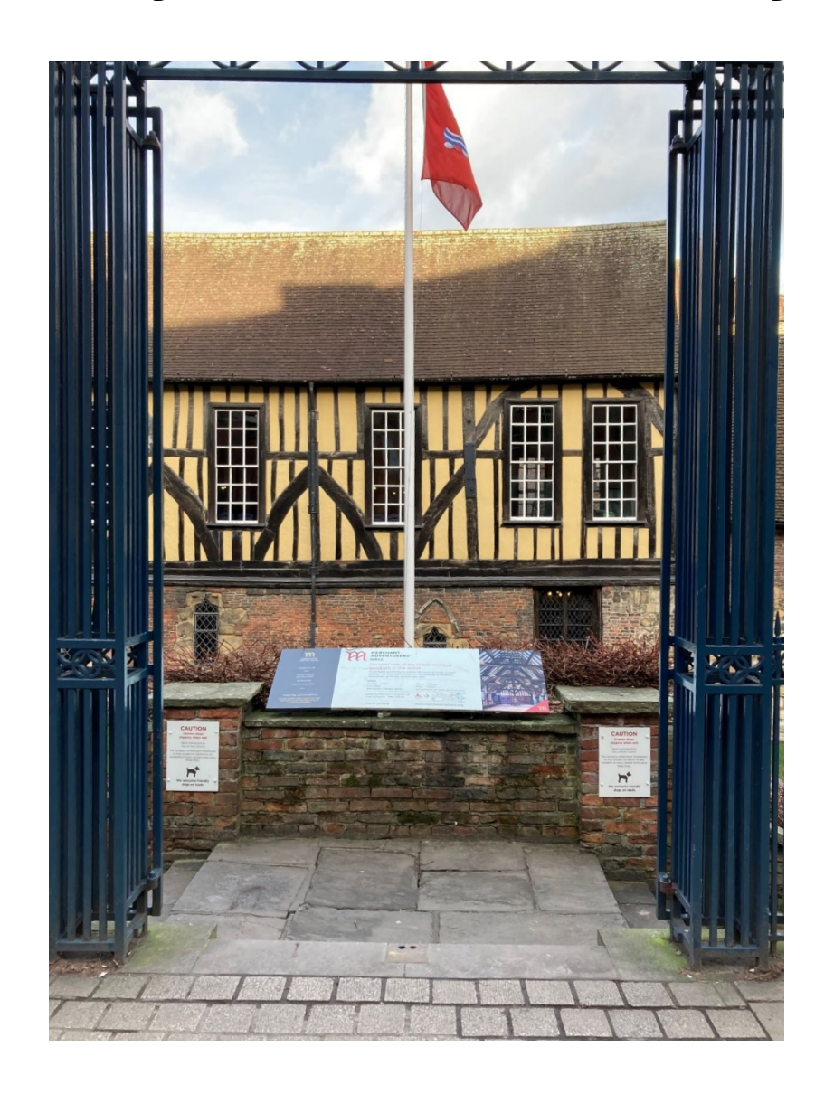
Information about your visit